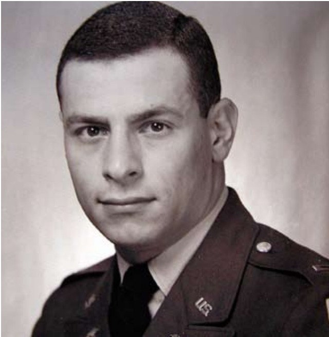
In the United States Army, circa 1965.

Those of us who know your work see only its public aspect. What makes up the remaining “behind the scenes” portion of your work?