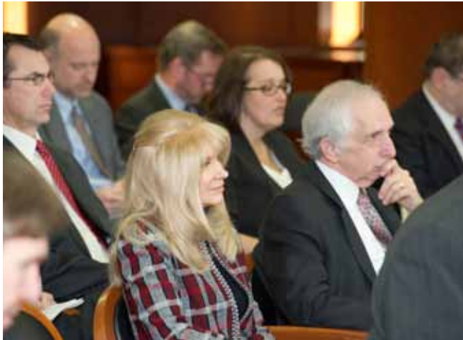
More than 100 IP professionals attended the program.