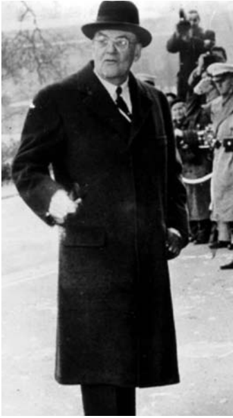
JOHN FOSTER DULLES (LL.B. 1911)

John Foster Dulles, U.S. secretary of state under President Dwight D. Eisenhower from 1953 to 1959, is one of GW Law's most distinguished alums, one who helped shape international law profoundly. After graduating first in his class from Princeton University, Dulles moved to Paris where he studied philosophy and international law at the Sorbonne. A year later, he moved to Washington, D.C., to live with his grandfather, John Watson Foster, and to enroll in GW Law.