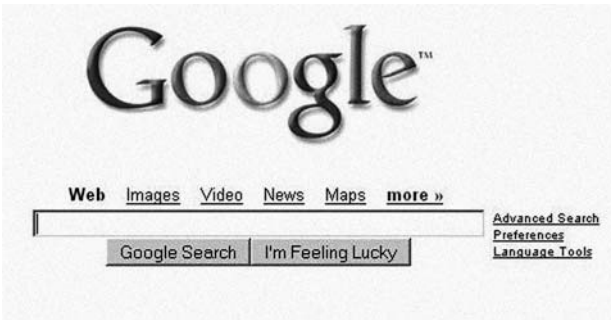
The Google search prompt

not just we ourselves who might leak information—data about us can be revealed by our friends or enemies, spouses or lovers, employers or employees, teachers or students . . . and even by strangers on the subway. We live in an age when many fragments of information about our lives are being gathered by new technologies, hoarded by companies in databases, and scattered across the Internet. Even people who have never gone online are likely to have some personal information on the Internet.