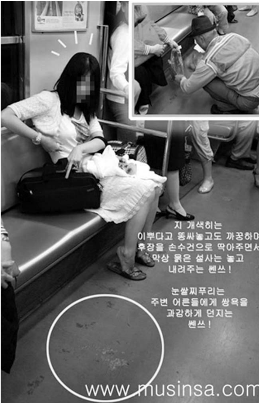
One of the digital posters of the dog poop girl circulating on the Internet