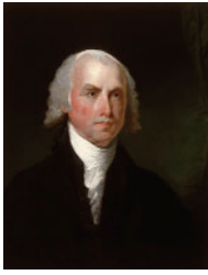
President James Madison. Oil on wood c.1821, by Gilbert Stuart. National Gallery of Art, Washington, DC

The year following the decisive 1781 French-assisted victory at Yorktown, the Congress of the Confederation appointed a committee “to report a list of books proper for the use of Congress.” Strikingly, this Congress, the immediate predecessor to the United States Congress, made the creation of a library one of its first designs, though the Revolutionary War had yet to end and negotiations for the Treaty of Paris would endure another year. James Madison of Virginia chaired the committee and, while joined by Hugh Williamson of North Carolina and Thomas Mifflin of Pennsylvania, Madison generally is considered the intellectual force behind the effort. The final list, containing over three hundred titles drawn from classic to then-contemporary works, is organized into categories weighted heavily toward law and history, with diplomacy and political science as strategically supporting subject areas. Although Congress ultimately decided that it was too heavily indebted to create a library at that juncture, the contents of the list remain revealing subjects of analysis. In essence, by creating a list of the works Congress should have at hand to inform its decision-making, Madison proposed a political canon for the revolutionary new nation.