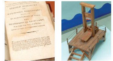
(top left) Robespierre’s oration in the National Convention appears as No. 4 in a volume of 54 revolutionary pamphlets [1792].

The text of the exhibit discussed the legal issues faced by the French National Convention while conducting the trial of the King of France. Brochures of this exhibit will be available upon request.