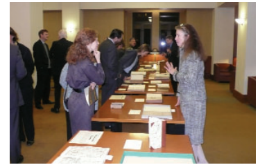
ASIL/ESIL guests mingle with rare books and librarians in the Law Library’s Tasher Great Room.

On January 12, 2008, at the closing reception held in the Tasher Great Room for the Joint Leadership Retreat of the American Society for International Law and the European Society for International Law, the Law Library mounted an exhibition featuring a selection of works from Special Collections. Books were displayed “in the open” on a long table which allowed attendees to examine the works closely and at their leisure. Included in the exhibition were works such as the Coutumes d’Anjou et du Maine (1486), the Malleus Maleficarum (1494), first editions of Napoleon’s Code Civil (1804), Beccaria’s Dei Delitti e Delle Pene (1764), and Hugo Grotius’s De Jure Belli Ac Pacis (1625), as well as representative works from the French Revolution.