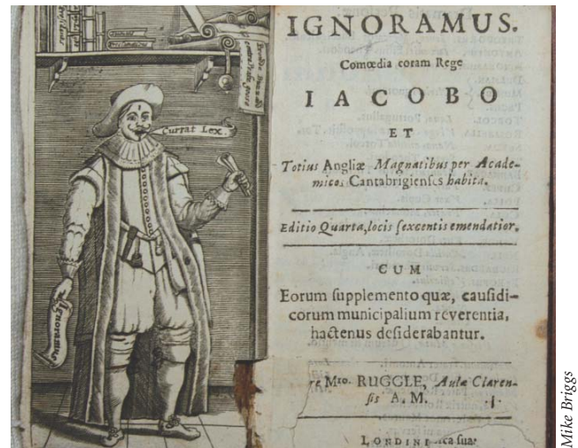
Frontispiece and title page of George Ruggle’s Ignoramus (London, 1668)

The eighteenth century brings Law and Lawyers Laid Open , a modern-sounding title dating from 1737 which continues the theme of satirical attack on lawyers. The episodes of the “twelve visions” in which the law is “laid open” skewer lawyers of all stripes in early eighteenth-century London, impugning their honesty and competence. In The Making of Modern Law collection (a digitized full-text database of more than 22,000 legal works dating from 1800 to 1926), we find The Pleader’s Guide :