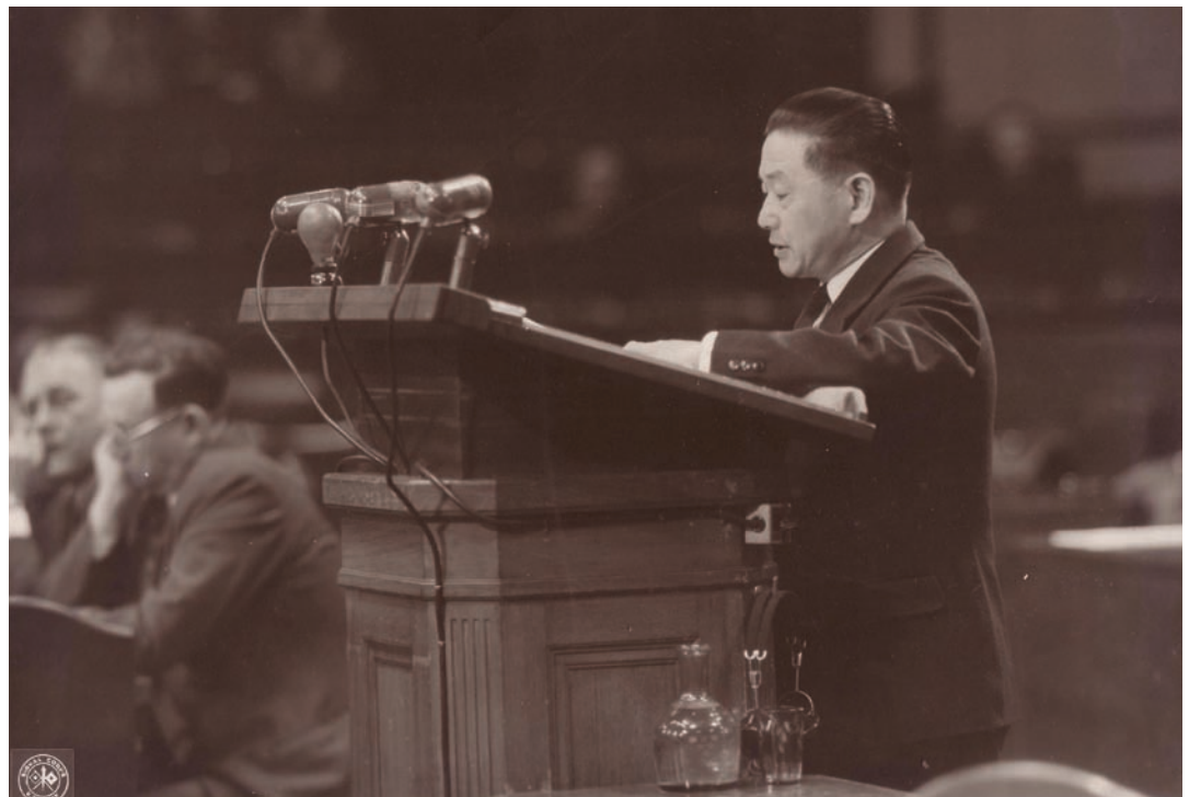
HSIANG CHE-CHUN (LL.B. 1925)