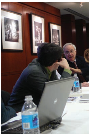
PROFESSOR BRUCE ACKERMAN FROM YALE LAW SCHOOL AT THE 2008 COMPARATIVE CONSTITUTIONAL LAW ROUNDTABLE.

The Comparative Constitutional Law Roundtable brings together comparative constitutional law scholars to discuss major issues in the field in the context of specific papers. About 20 to 30 scholars are invited,